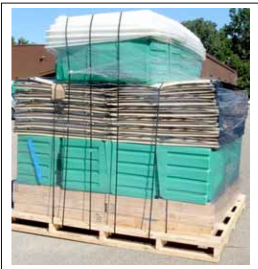
12 Complete Model FPT 300 Ready to Ship

Cost Efficient Loading & Shipping Options