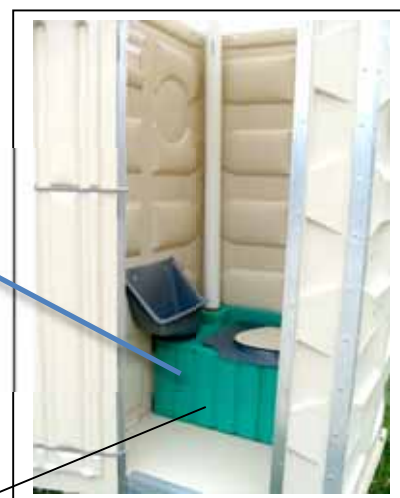
Front View of Flip Top Tank

Our reference list (see below) is testimony to the success of the portable toilets we manufacture and service. The Green John® offers long-term low maintenance sanitation.