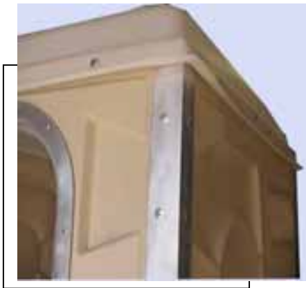
2" Aluminum Corners For Durability