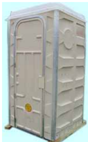
One Piece Aluminum Door Frame