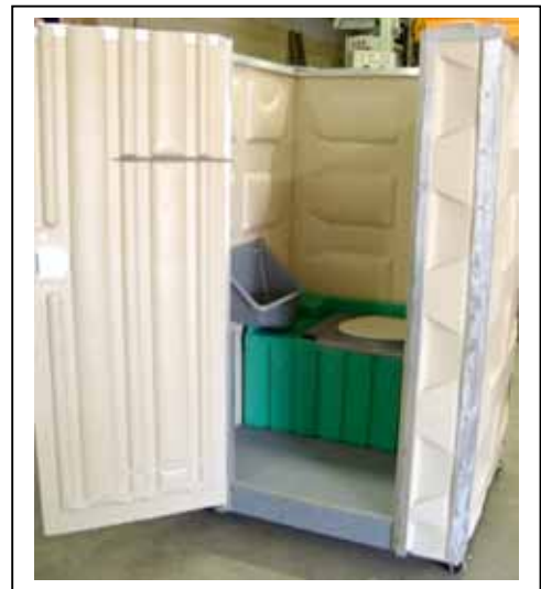
Cut Off Model GJ 350CO