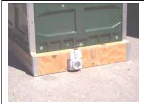
Dump Valve Model GJDV 350