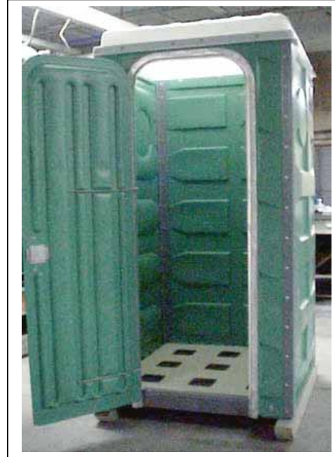
Flat Floor Model GJFF 350