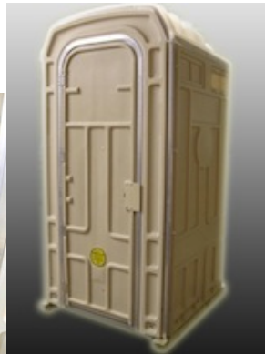
SJSDCS 520 Comfort Station